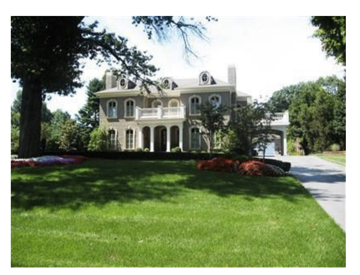
Coach Calipari's House (Richmond Rd Area) Black Circle