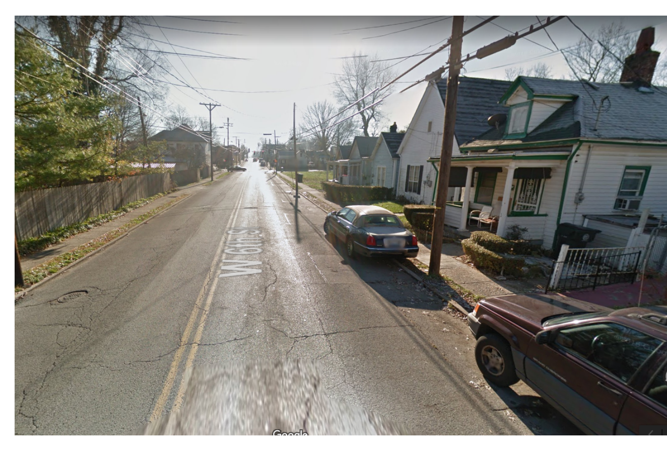
Graded D Area Blue Circle

The 1930s red-line data and the current infill and redevelopment boundary allow us to better understand the connection between Lexington's racial history of urban development and contemporary redevelopment strategies.