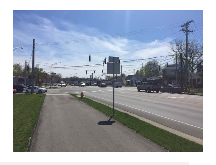
Low visibility and poor signage combined with an atypical 4 way intersection may be a contributing factor to the high collision rates at this intersection.