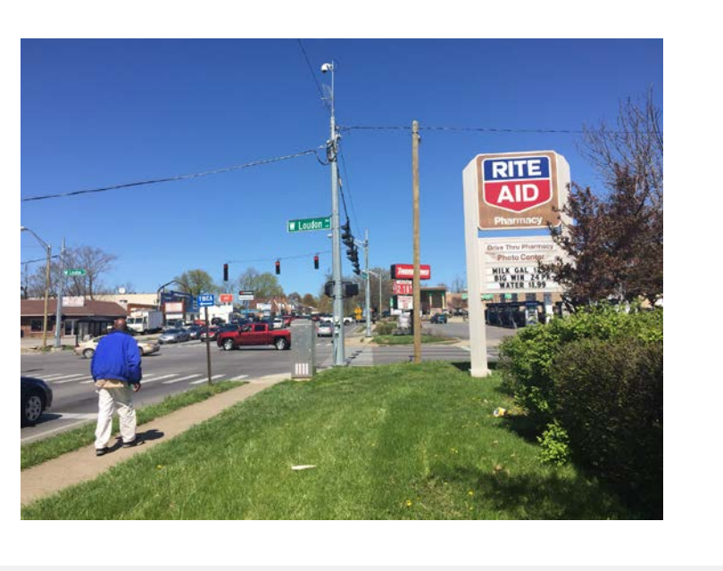
The lack of minor roadways around the intersection leads to heavy congestion when entering the area's many local establishments. Low visibility and high traffic volume remain an issue in this area.