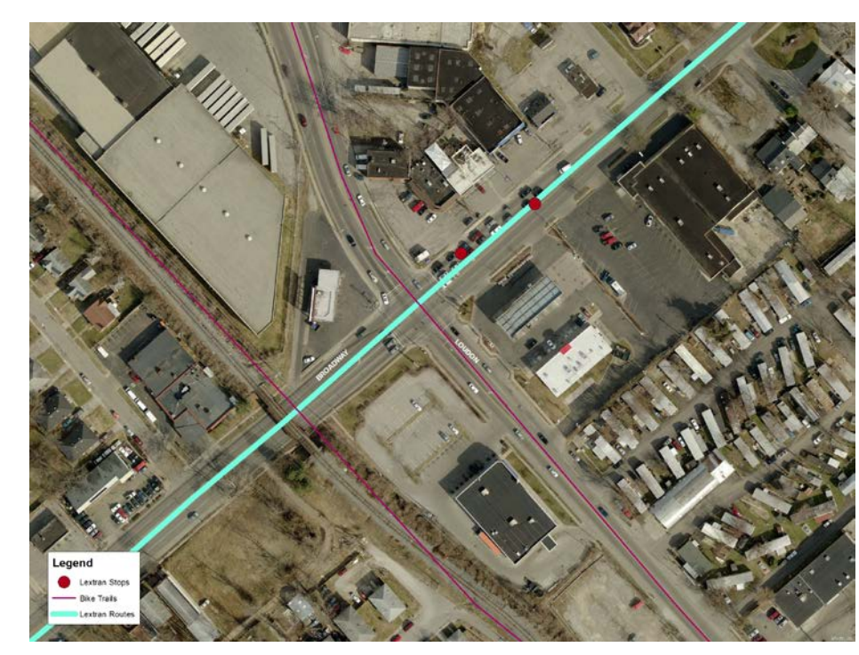
AADT – 16,149 ADBR – 4,195

These graphics display accessibility to transportation in the area such as bicycle lanes, bus stops and bus routes.