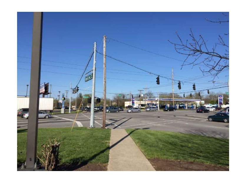
The large amount of u-turn intersections is likely a major cause of collisions on this road segment. This area of new circle is also one of the highest areas of traffic in the Lexington area.