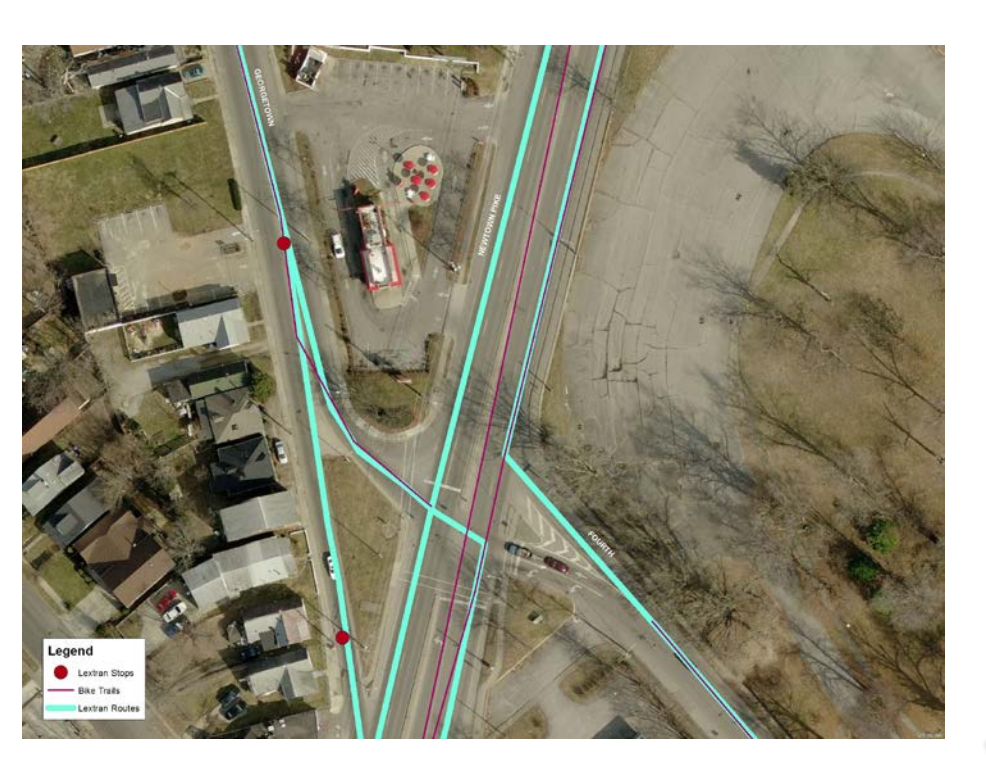
AADT – 25,431 ADBR – 8,696